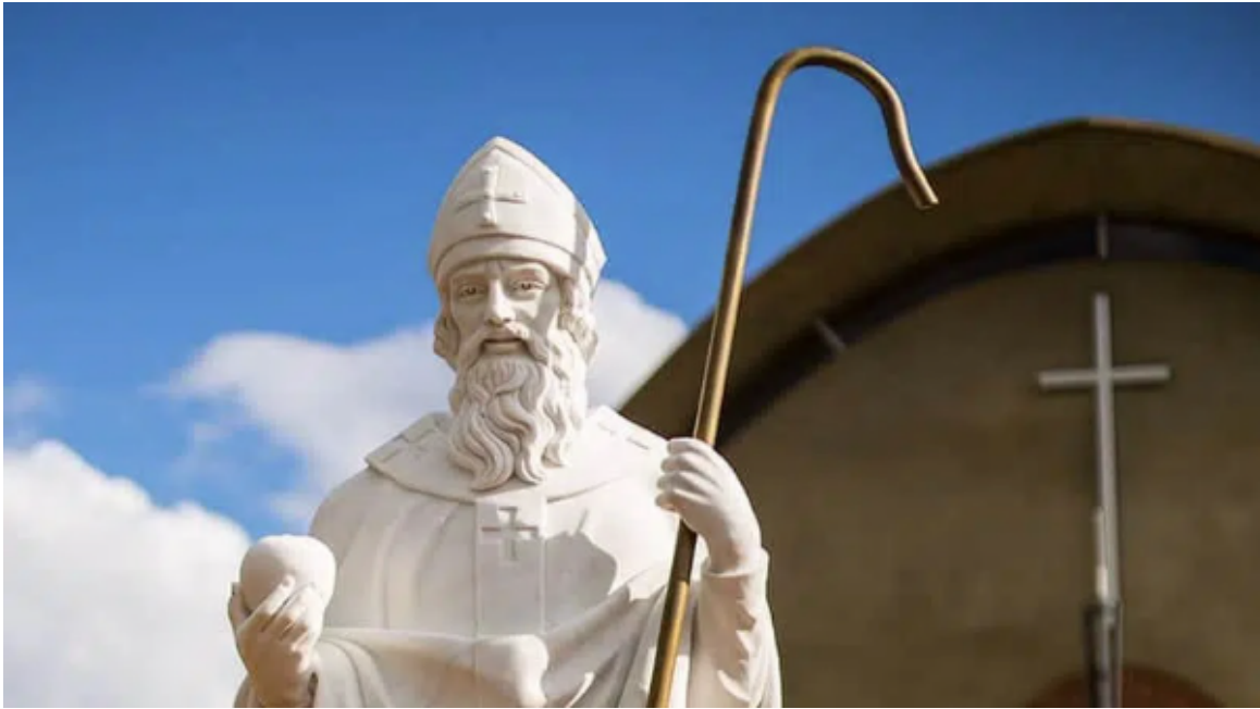
Irish Saint Malachy

While in Rome in 1139, Saint Malachy received a vision that showed him all the popes from his own time until the end of the time. He wrote brief poetic descriptions of each pontiff and presented the complete manuscript to Pope Innocent II. At the time, however, no one understood the prophetic meaning of these descriptions, so the manuscript was placed in the Vatican Secret Archives and forgotten until 1590.